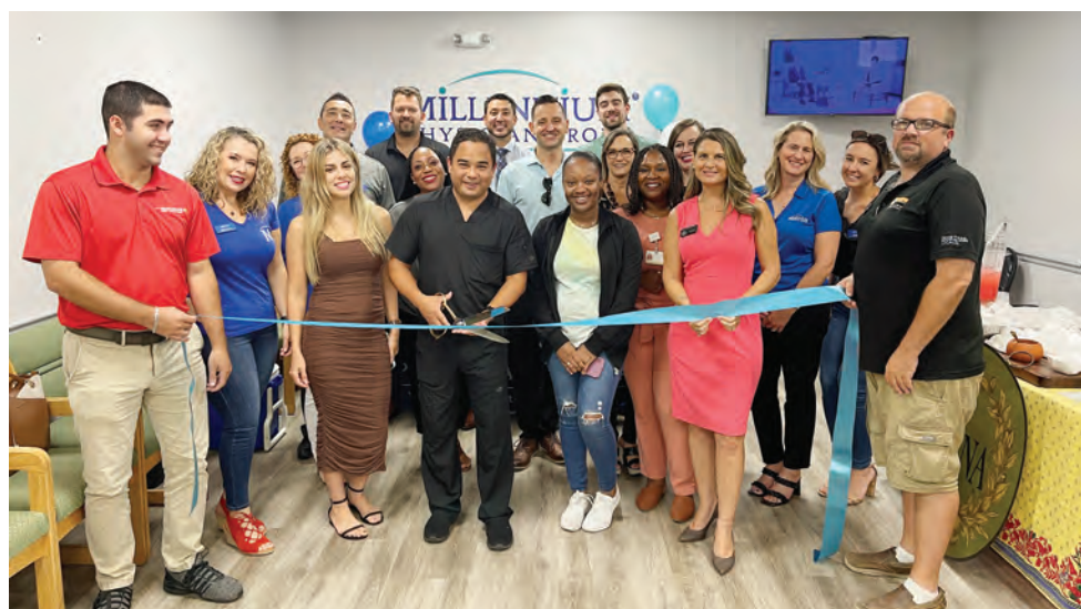
Millennium Physician Group, Health Care Services, 1708 Cape Coral Parkway W., Suite 6, Cape Coral, FL 33904, (239) 935-8782, www.MillenniumPhysician.com