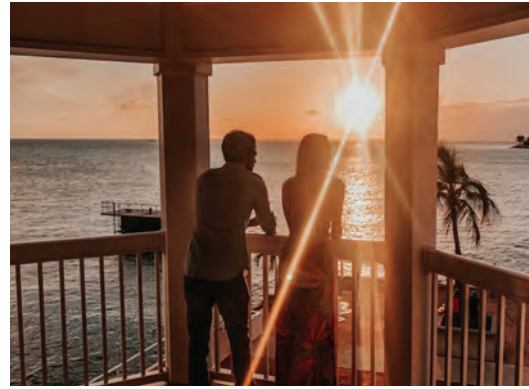
Relaxing at Key West resort

I am just a Southwest Florida middle-aged woman who “finally” decided to go after it all: a career on my terms, motherhood, fitness, eco-living and adventure. I want to inspire people to take care of your health and our planet, to spend authentic time with your family and to chase your dreams unapologetically! We only get one life, don’t waste it waiting. From playtime to home building to travel – enjoy every moment, big and small! In addition to my favorite job of being the mother to two crazy little kids, I am the marketing director for WooBamboo, a freelance writer, and I run my own small business as a virtual marketing assistant.