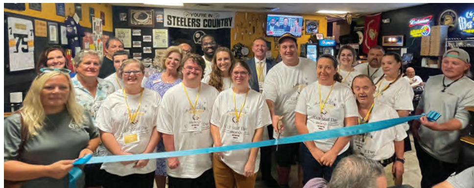
Lelulo's Pizzeria, Restaurant, 3123 Chiquita Blvd. S., Cape Coral, FL 33914, (239) 205-6935, www.lelulospizza.com