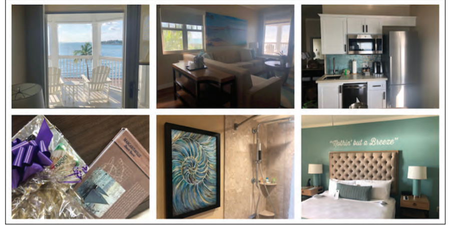
Margaritaville room photo collage