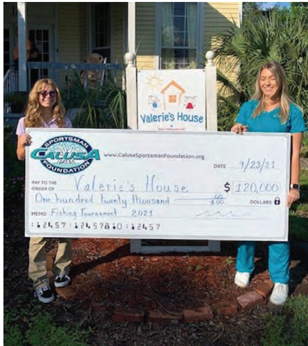
Last year's event netted $120,000 for Valerie's House.