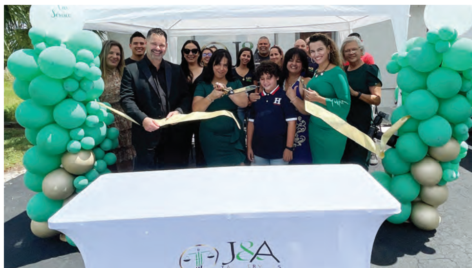
J & A Tax Services, Tax Services, 1634 S.E. 47th St., Suite 20, Cape Coral, FL 33904, (239) 703-3974