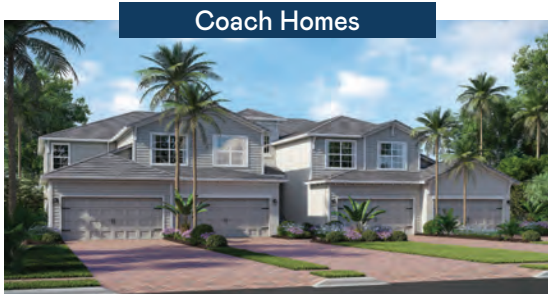
Coach Homes 1,741 to 2,110 Sq. Ft. Living A/C

The Clubhouse will offer both casual & formal dining options to delight your tastebuds. The friendly staff will offer a variety of special events and functions where neighbors and friends can mingle, dine and dance. A full-time Activities Director will partner will be on staff to help residents share various hobbies, clubs and games.