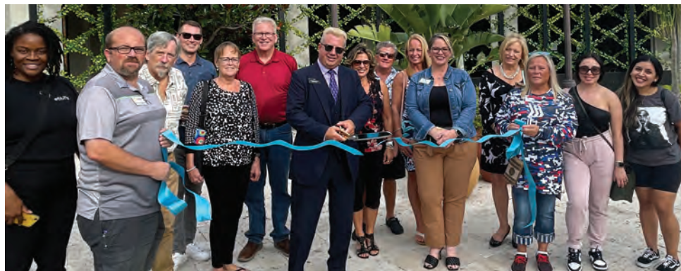
Coconut Point Mall, Shopping Center, 23106 Fashion Drive, Suite 107, Estero, FL 33928, (239) 992-9966, www.simon.com