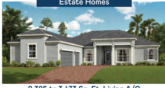
Estate Homes 2,395 to 3,473 Sq. Ft. Living A/C