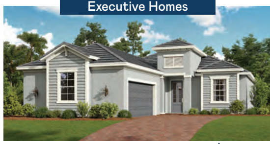
Executive Homes 1,850 to 2,247 Sq. Ft. Living A/C