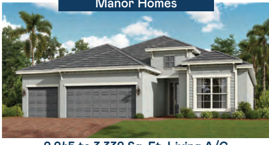
Manor Homes 2,245 to 3,332 Sq. Ft. Living A/C