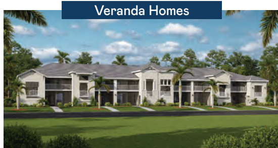
Veranda Homes 1,355 to 1,569 Sq. Ft. Living A/C