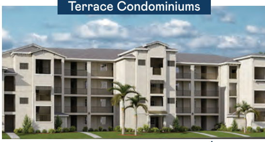
Terrace Condominiums 1,120 to 1,301 Sq. Ft. Living A/C