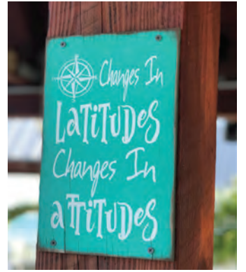
Key West pool sign