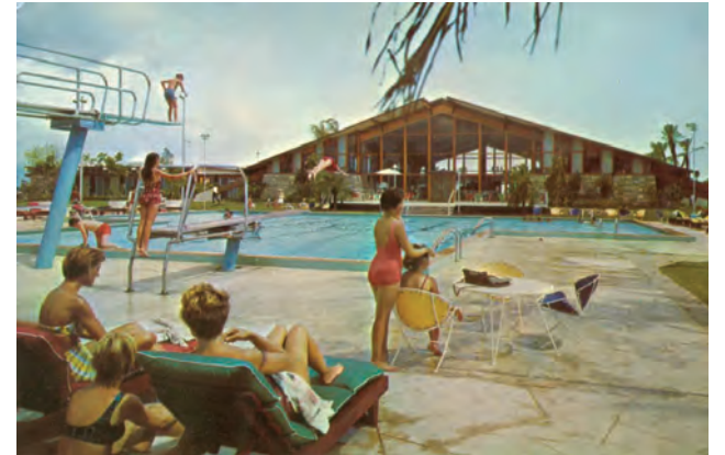
Cape Coral Yacht Club pool

Are you a student seeking to fulfill your community service obligation? The museum regularly partners