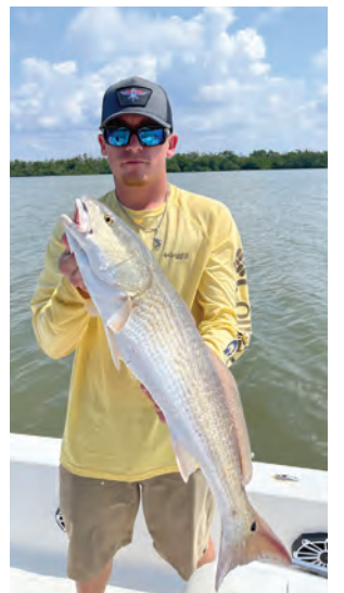
A successful angler displaying his catch